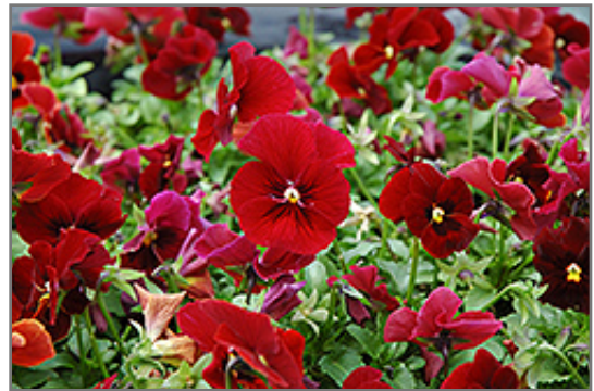
Penny Red Pansy flowers