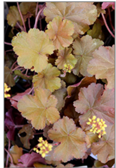
Sirens' Song Orange Delight Coral Bells foliage