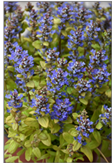
Feathered Friends Fancy Finch Bugleweed flowers