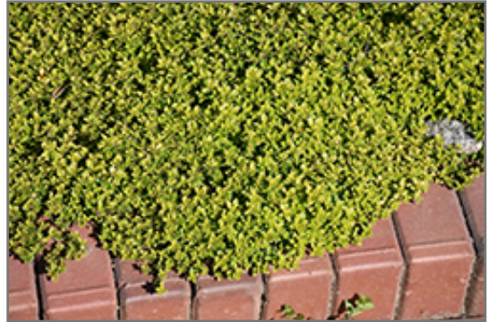
Archer's Gold Thyme

Archer's Gold Thyme's attractive tiny fragrant round leaves remain chartreuse in color with hints of yellow throughout the year on a plant with a spreading habit of growth.