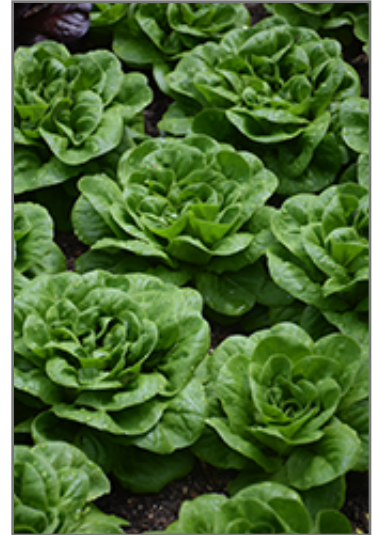
Buttercrunch Lettuce

Buttercrunch Lettuce will grow to be about 12 inches tall at maturity, with a spread of 6 inches. When planted in rows, individual plants should be spaced approximately 8 inches apart. This vegetable plant is an annual, which means that it will grow for one season in your garden and then die after producing a crop. Because of its relatively short time to maturity, it lends itself to a series of successive plantings each staggered by a week or two; this will prolong the effective harvest period.