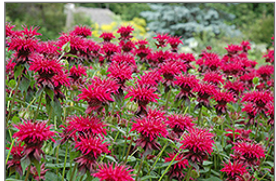
Raspberry Wine Beebalm flowers

Raspberry Wine Beebalm is recommended for the following landscape applications;