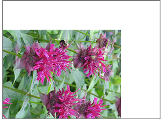
Raspberry Wine Beebalm flowers

Raspberry Wine Beebalm will grow to be about 30 inches tall at maturity, with a spread of 32 inches. When grown in masses or used as a bedding plant, individual plants should be spaced approximately 28 inches apart. It grows at a fast rate, and under ideal conditions can be expected to live for approximately 5 years. As an herbaceous perennial, this plant will usually die back to the crown each winter, and will regrow from the base each spring. Be careful not to disturb the crown in late winter when it may not be readily seen!