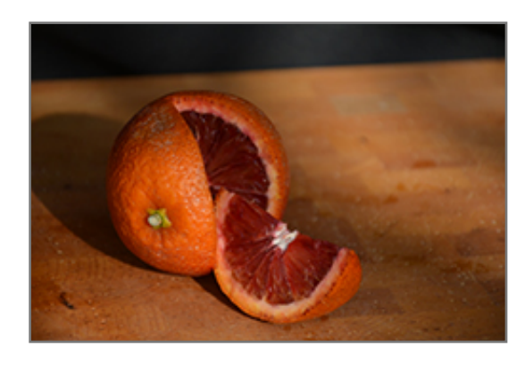
Moro Blood Orange fruit