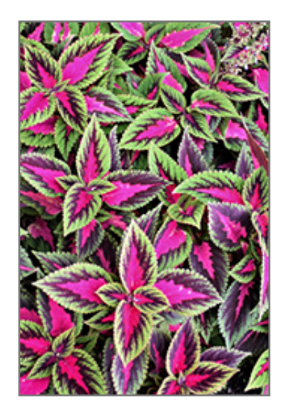
Ruby Road Coleus foliage