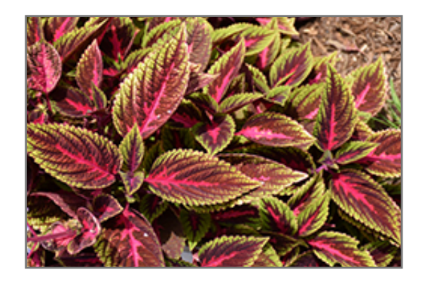
Ruby Road Coleus foliage