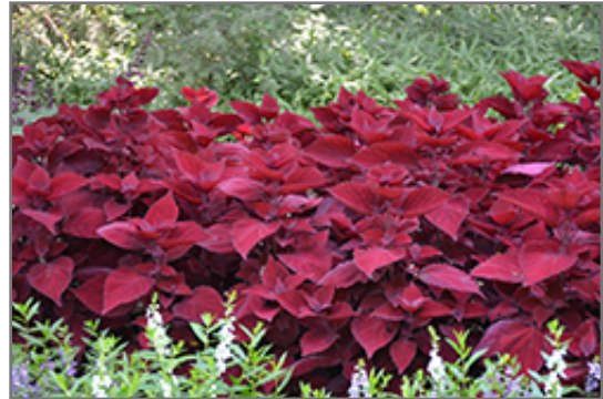
Beale Street Coleus