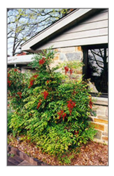
Nandina fruit

Nandina is recommended for the following landscape applications;