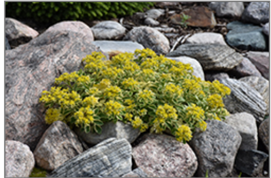
Atlantis Stonecrop in bloom