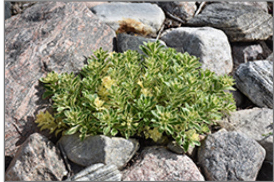
Atlantis Stonecrop