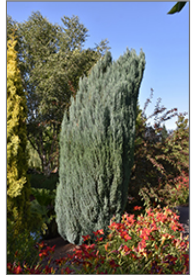
Blue Surprise Port Orford Cedar

This shrub does best in full sun to partial shade. It does best in average to evenly moist conditions, but will not tolerate standing water. It is not particular as to soil type, but has a definite preference for acidic soils. It is somewhat tolerant of urban pollution. Consider applying a thick mulch around the root zone in winter to protect it in exposed locations or colder microclimates. This is a selection of a native North American species.