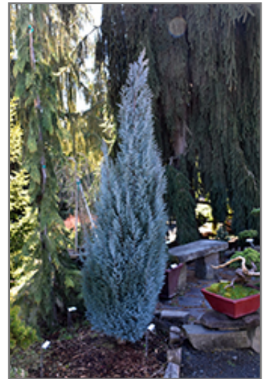
Blue Surprise Port Orford Cedar