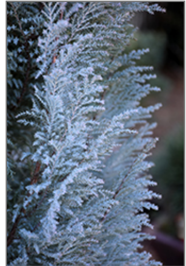
Blue Surprise Port Orford Cedar foliage