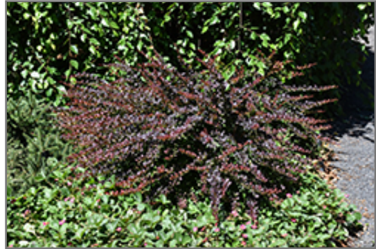
Lava Nugget Barberry

Lava Nugget Barberry is recommended for the following landscape applications;