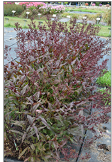
Pocahontas Beard Tongue

Pocahontas Beard Tongue is recommended for the following landscape applications;