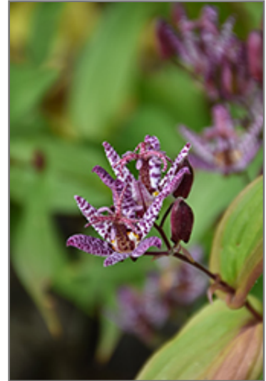
Toad Lily flowers