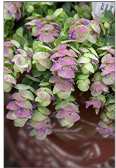
Kirigami Oregano flowers

Kirigami Oregano is recommended for the following landscape applications;