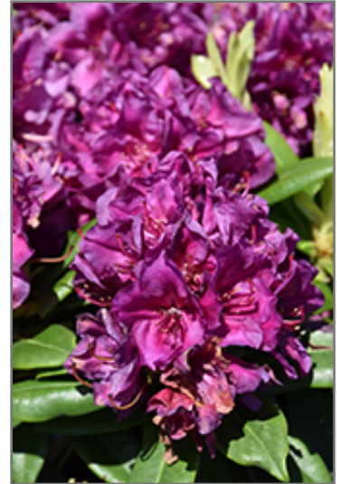
Polarnacht Rhododendron flowers

Polarnacht Rhododendron will grow to be about 3 feet tall at maturity, with a spread of 5 feet. It tends to be a little leggy, with a typical clearance of 1 foot from the ground. It grows at a slow rate, and under ideal conditions can be expected to live for 40 years or more.