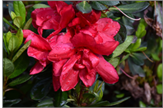
Encore Autumn Bonfire Azalea flowers

Encore Autumn Bonfire Azalea will grow to be about 3 feet tall at maturity, with a spread of 4 feet. It tends to be a little leggy, with a typical clearance of 1 foot from the ground. It grows at a slow rate, and under ideal conditions can be expected to live for 40 years or more.