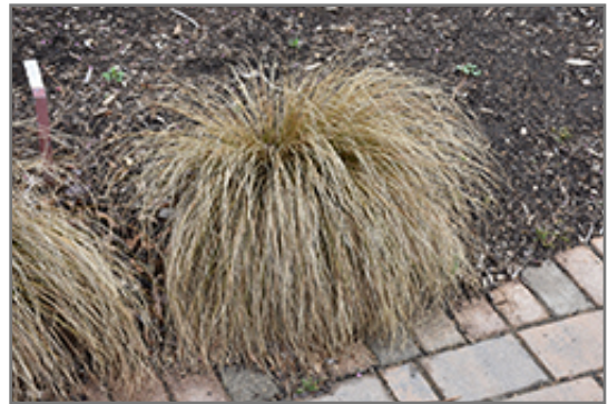
Prairie Fire Sedge

Prairie Fire Sedge is recommended for the following landscape applications;