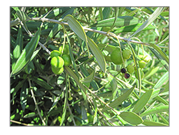
Little Ollie&reg Dwarf Olive fruit