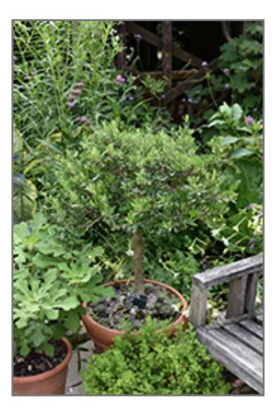
Little Ollie&reg Dwarf Olive

Little Ollie&reg Dwarf Olive is recommended for the following landscape applications;