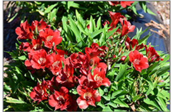
Colorita Kate Alstroemeria in bloom