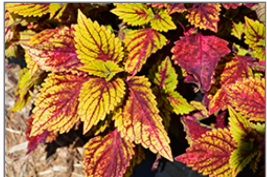
Color Clouds Hottie Coleus foliage

Color Clouds Hottie Coleus is recommended for the following landscape applications;