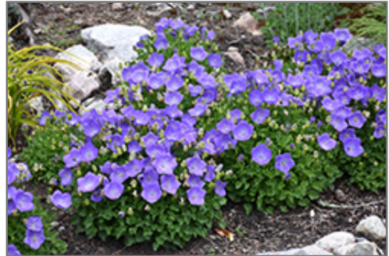
Rapido Blue Bellflower in bloom