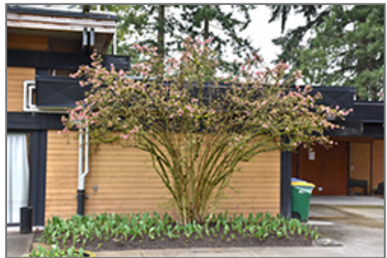
Pink Dawn Viburnum in bloom