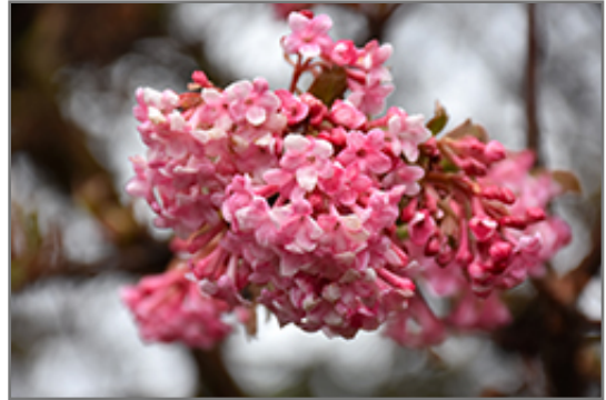
Pink Dawn Viburnum flowers

Pink Dawn Viburnum is recommended for the following landscape applications;