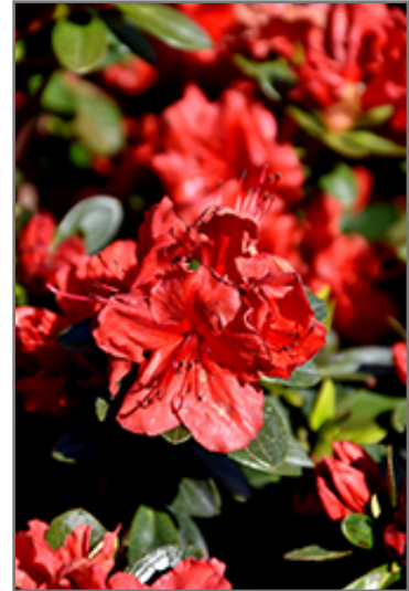
Girard's Scarlet Azalea flowers

Girard's Scarlet Azalea will grow to be about 4 feet tall at maturity, with a spread of 4 feet. It tends to be a little leggy, with a typical clearance of 1 foot from the ground. It grows at a slow rate, and under ideal conditions can be expected to live for 40 years or more.