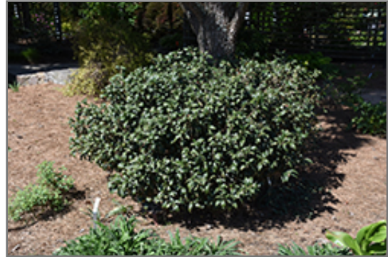
Chestnut Hill Cherry Laurel

Chestnut Hill Cherry Laurel is recommended for the following landscape applications;