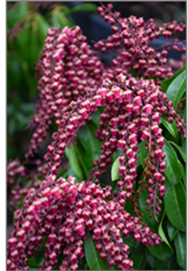
Gay Goblin Japanese Pieris flowers

A truly ornamental broadleaf evergreen shrub, prized for its delicate and showy chains of bright red bell-shaped flowers and bronze emerging foliage, dense and upright; performs best in moist, organic and acidic soils