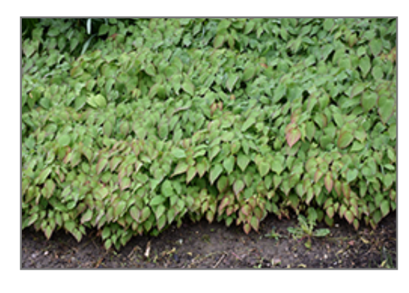
Bishop's Hat

Bishop's Hat is a fine choice for the garden, but it is also a good selection for planting in outdoor pots and containers. Because of its spreading habit of growth, it is ideally suited for use as a 'spiller' in the 'spiller-thriller-filler' container combination; plant it near the edges where it can spill gracefully over the pot. Note that when growing plants in outdoor containers and baskets, they may require more frequent waterings than they would in the yard or garden.