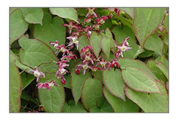
Bishop's Hat flowers

Bishop's Hat is a dense herbaceous evergreen perennial with a ground-hugging habit of growth. Its relatively fine texture sets it apart from other garden plants with less refined foliage.