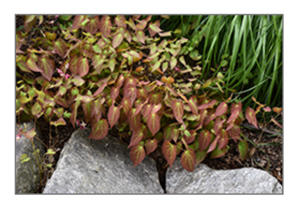
Bishop's Hat