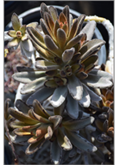
Chocolate Soldier Panda Plant

This is an herbaceous evergreen houseplant with a mounded form. This plant may benefit from an occasional pruning to look its best.