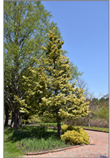
Cripps Gold Falsecypress

This tree does best in full sun to partial shade. It prefers to grow in average to moist conditions, and shouldn't be allowed to dry out. It is not particular as to soil type or pH. It is highly tolerant of urban pollution and will even thrive in inner city environments, and will benefit from being planted in a relatively sheltered location. Consider applying a thick mulch around the root zone in winter to protect it in exposed locations or colder microclimates. This is a selected variety of a species not originally from North America.