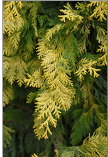
Cripps Gold Falsecypress foliage