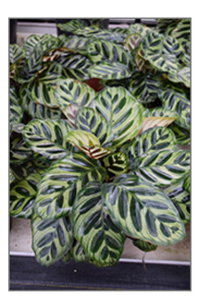
Peacock Plant in full

There are many factors that will affect the ultimate height, spread and overall performance of a plant when grown indoors; among them, the size of the pot it's growing in, the amount of light it receives, watering frequency, the pruning regimen and repotting schedule. Use the information described here as a guideline only; individual performance can and will vary. Please contact the store to speak with one of our experts if you are interested in further details concerning recommendations on pot size, watering, pruning, repotting, etc.