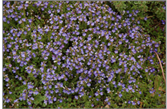
Turkish Speedwell in bloom

Turkish Speedwell is recommended for the following landscape applications;