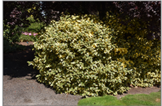
Gilt Edge Silverberry