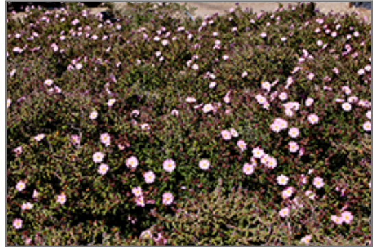
Pink Rockrose in bloom