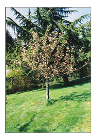
Stella Cherry in bloom

This is a deciduous tree with a more or less rounded form. Its average texture blends into the landscape, but can be balanced by one or two finer or coarser trees or shrubs for an effective composition. This plant will require occasional maintenance and upkeep, and is best pruned in late winter once the threat of extreme cold has passed. It is a good choice for attracting birds to your yard. Gardeners should be aware of the following characteristic(s) that may warrant special consideration;