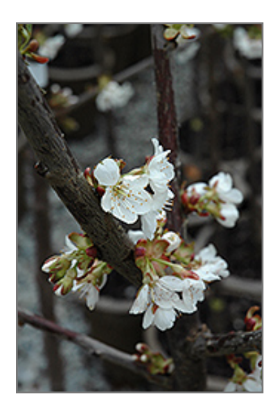
Stella Cherry flowers