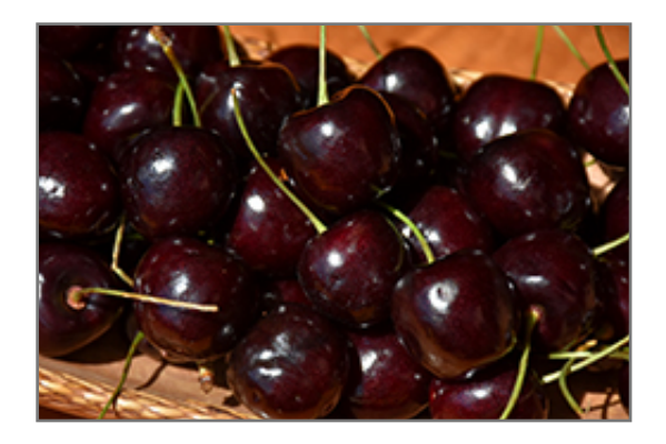
Stella Cherry fruit