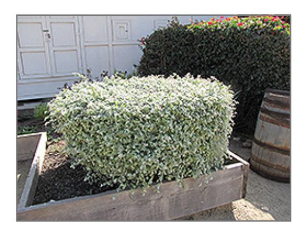
Licorice Plant