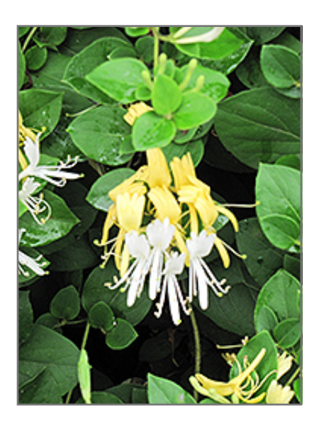
Hall's Japanese Honeysuckle flowers