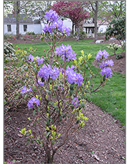
Blue Baron Rhododendron in bloom

This shrub does best in full sun to partial shade. You may want to keep it away from hot, dry locations that receive direct afternoon sun or which get reflected sunlight, such as against the south side of a white wall. It requires an evenly moist well-drained soil for optimal growth, but will die in standing water. It is very fussy about its soil conditions and must have rich, acidic soils to ensure success, and is subject to chlorosis (yellowing) of the foliage in alkaline soils. It is somewhat tolerant of urban pollution, and will benefit from being planted in a relatively sheltered location. Consider applying a thick mulch around the root zone in winter to protect it in exposed locations or colder microclimates. This particular variety is an interspecific hybrid.