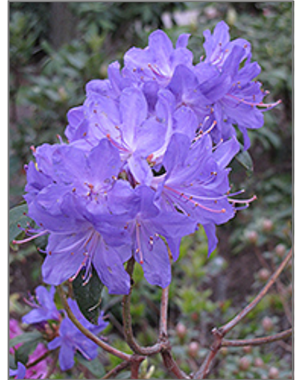
Blue Baron Rhododendron flowers