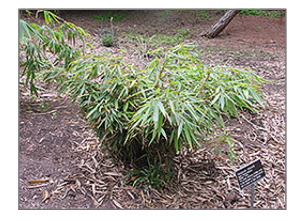
Clump Bamboo