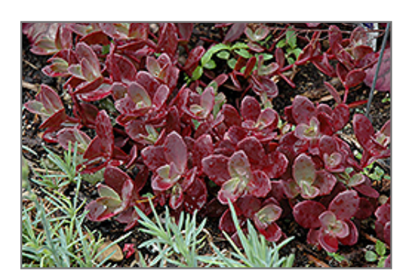
Firecracker Stonecrop foliage