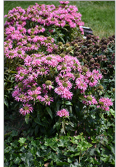
Pardon My Pink Beebalm in bloom