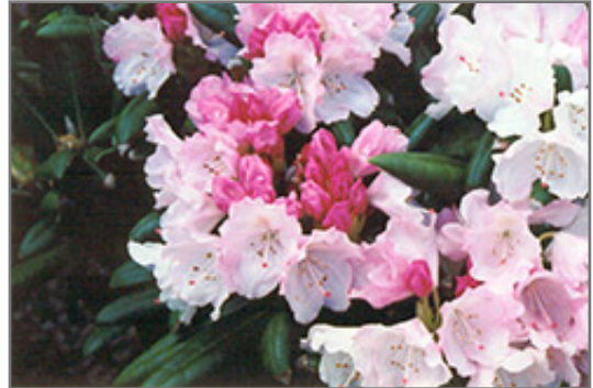
Crete Rhododendron flowers

Crete Rhododendron will grow to be about 3 feet tall at maturity, with a spread of 3 feet. It has a low canopy. It grows at a slow rate, and under ideal conditions can be expected to live for 50 years or more.