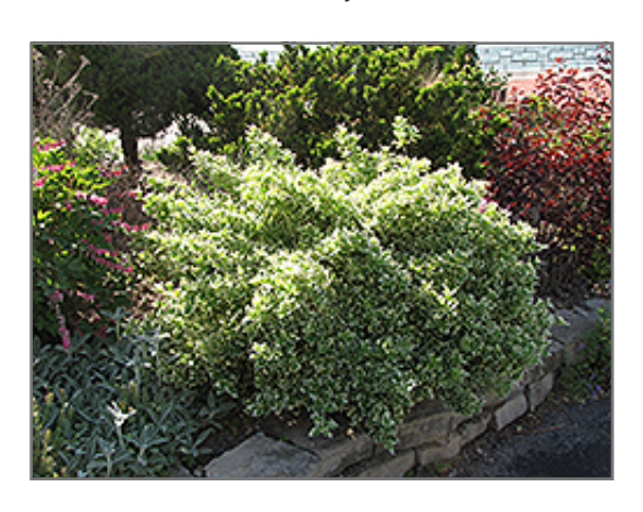
Emerald Gaiety Wintercreeper

Emerald Gaiety Wintercreeper is recommended for the following landscape applications;