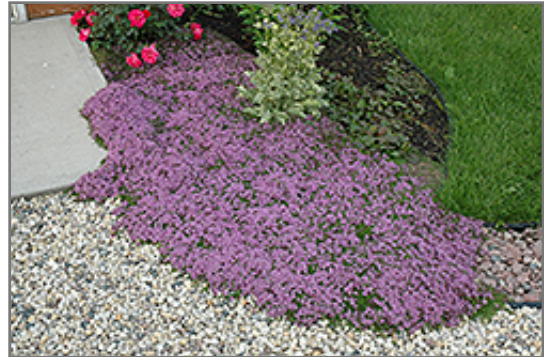
Red Creeping Thyme in bloom