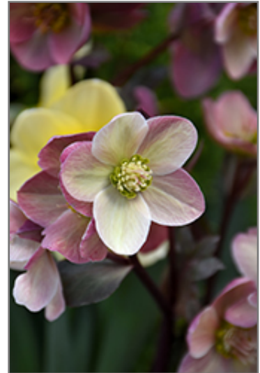
Pink Frost Hellebore flowers