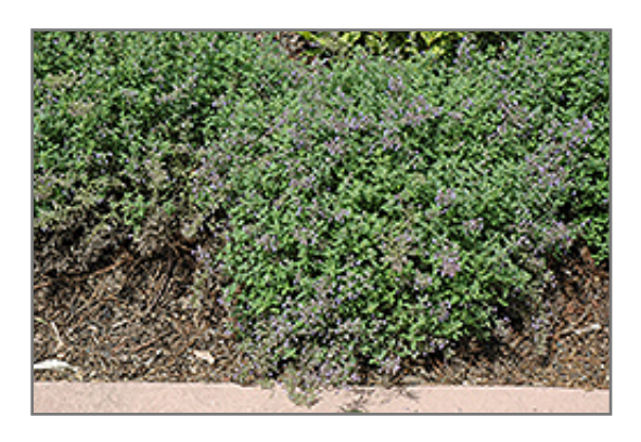
Junior Walker Catmint in bloom