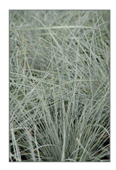
Beyond Blue Blue Fescue foliage