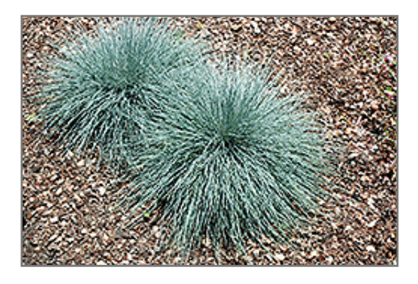
Beyond Blue Blue Fescue