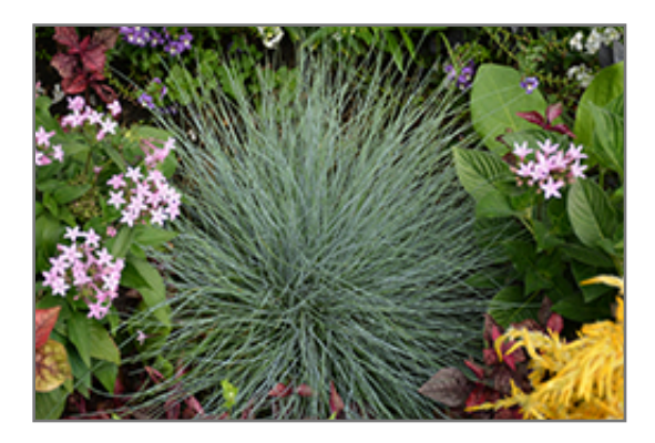
Beyond Blue Blue Fescue

This plant does best in full sun to partial shade. It prefers to grow in average to dry locations, and dislikes excessive moisture. It is considered to be drought-tolerant, and thus makes an ideal choice for a low-water garden or xeriscape application. It is not particular as to soil type or pH. It is highly tolerant of urban pollution and will even thrive in inner city environments. This is a selected variety of a species not originally from North America. It can be propagated by division; however, as a cultivated variety, be aware that it may be subject to certain restrictions or prohibitions on propagation.