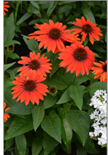
Sombrero Flamenco Orange Coneflower in bloom

Sombrero Flamenco Orange Coneflower is recommended for the following landscape applications;