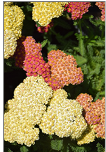
Desert Eve Terracotta Yarrow flowers

Desert Eve Terracotta Yarrow is recommended for the following landscape applications;