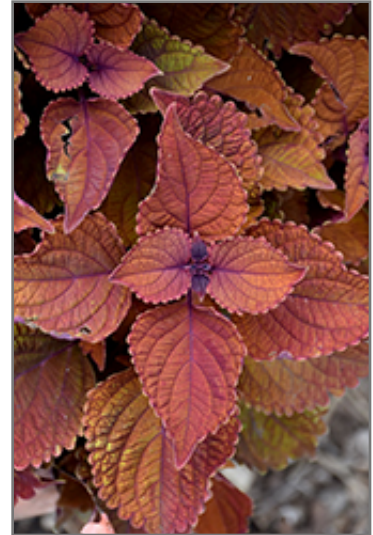
Wall Street Coleus foliage